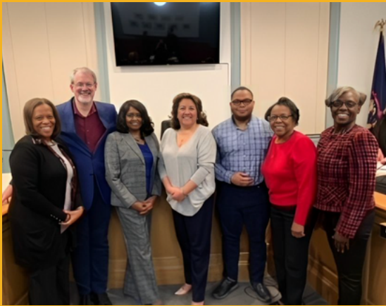
Albion City Council

On behalf of the City of Albion, welcome to Albion. We're so glad that you are here! We love Albion and hope you will too.